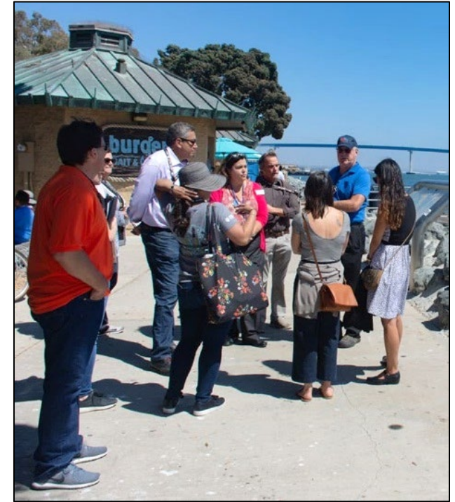
Site visit with Coastal Staff – 2019 Comic-Con