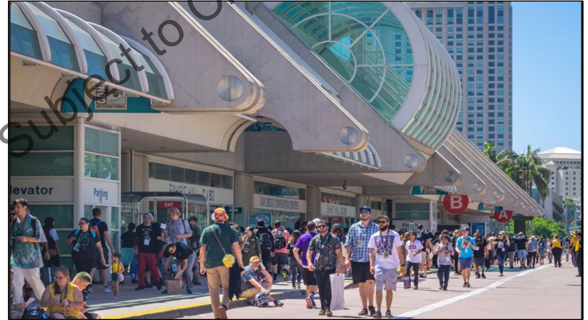
Front driveway and sidewalk