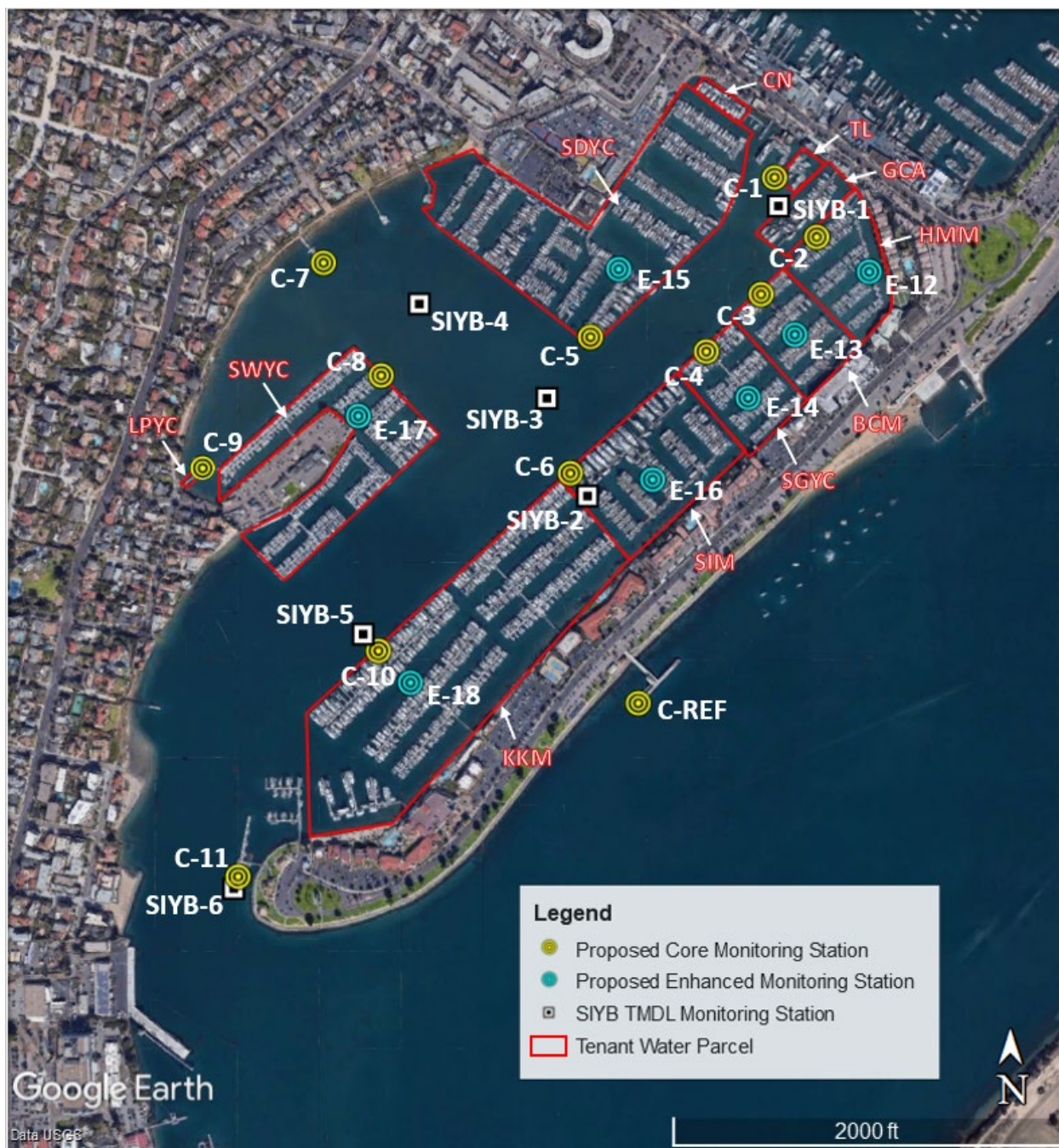
Figure 4-1. Proposed Core and Enhanced Monitoring Stations

Notes: BCM = Bay Club Marina; CN = Crow's Nest Yachts; GCA = Gold Coast Anchorage; HMM = Half Moon Marina; KKM = Kona Kai Marina; LPYC = La Playa Yacht Club; SDYC = San Diego Yacht Club; SGYC = Silver Gate Yacht Club; SIYB = Shelter Island Yacht Basin; SIM = Shelter Island Marina; SWYC = Southwestern Yacht Club; TL = Tonga Landing