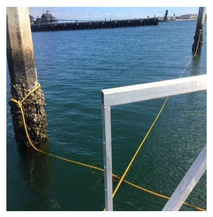
FLUPSY TEMPORARILY TIED TO ADJACENT UNUSED PILES