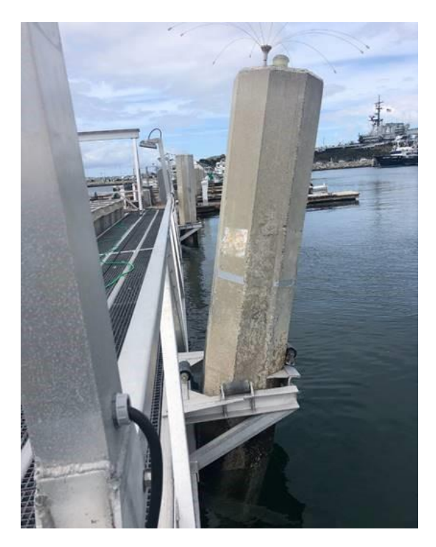
FLUPSY ATTACHED TO PILES