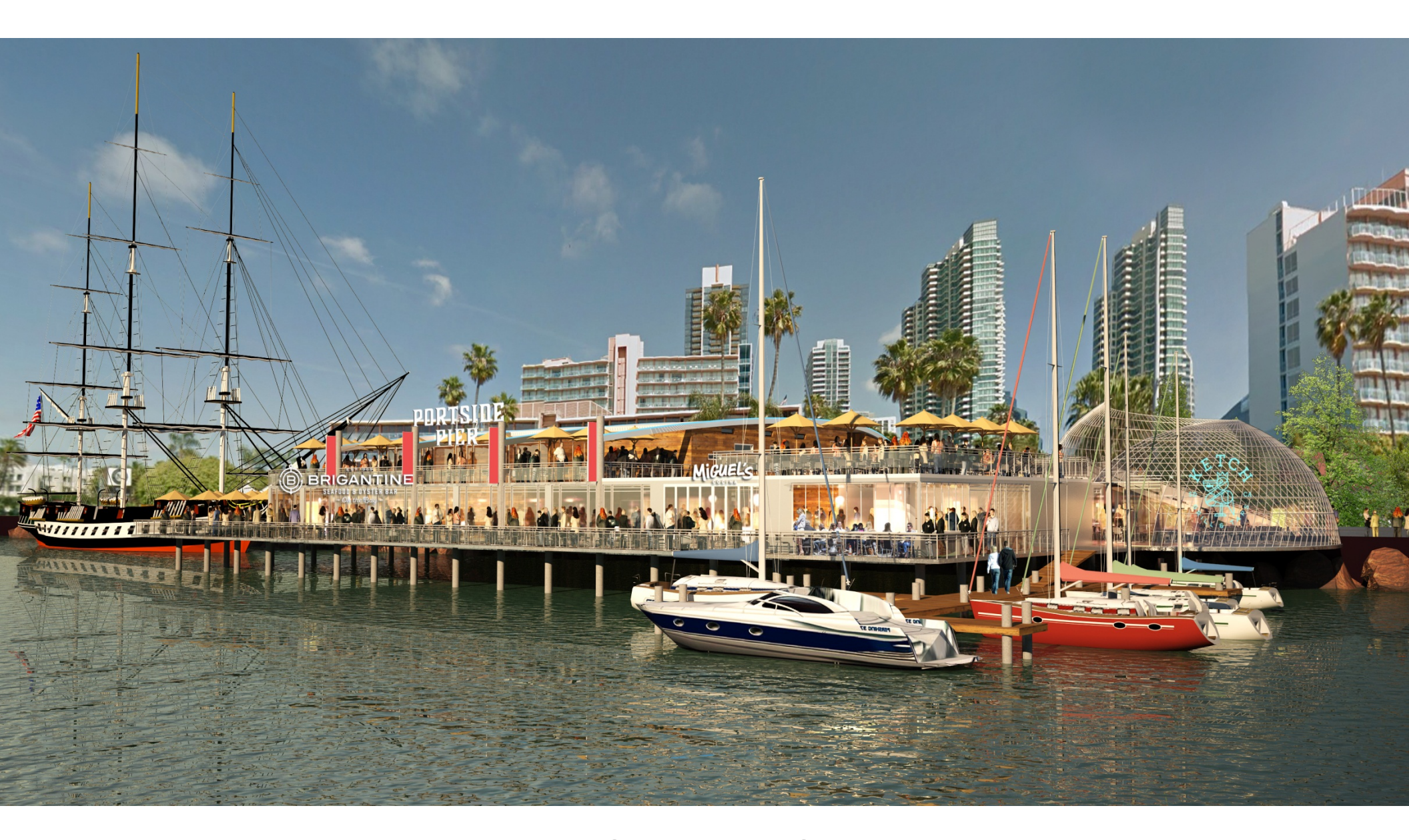
BRIGANTINE BAYSIDE VIEW