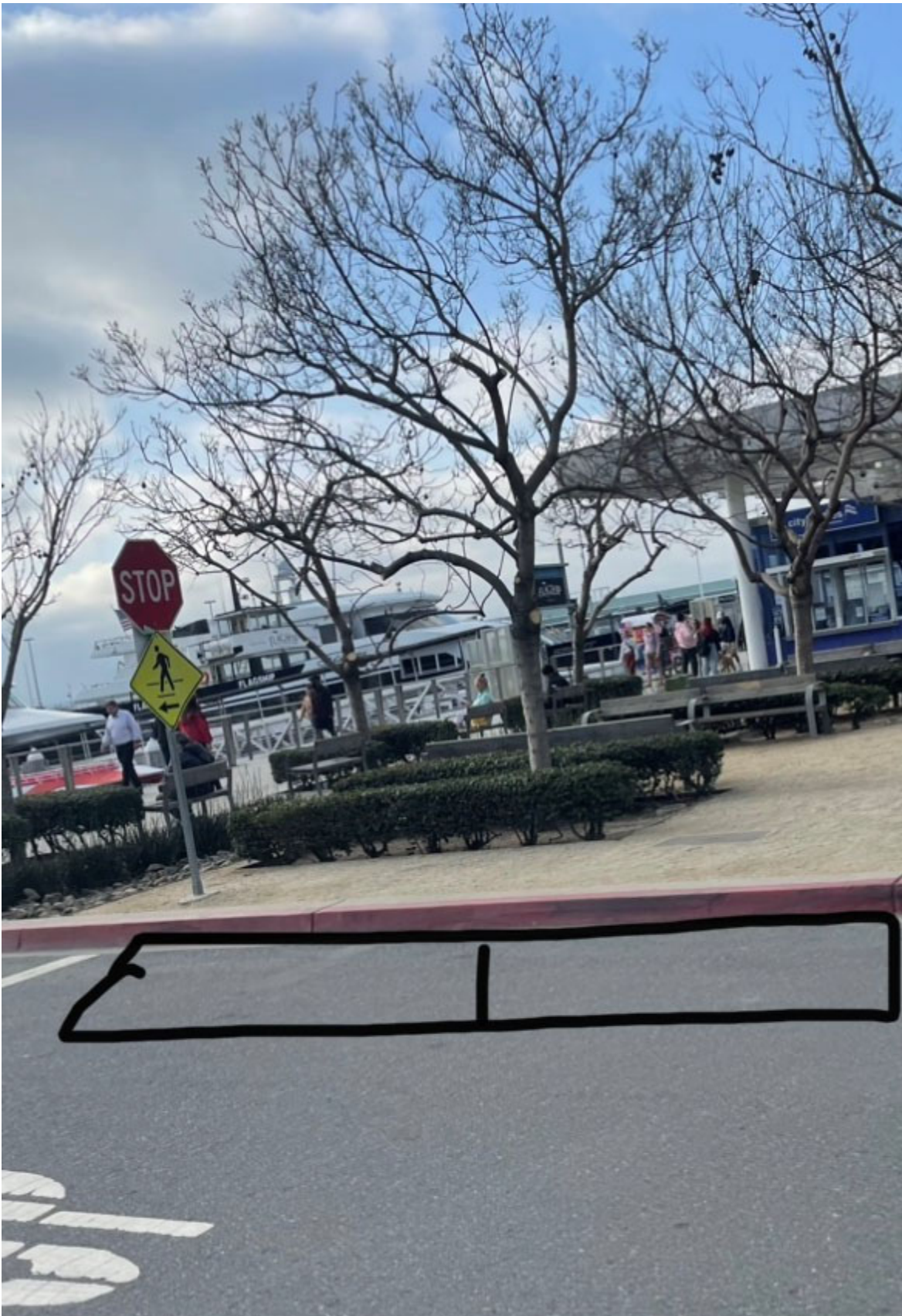
Pedicab parking spots to be able to park by Harbor Tours boats and Ferry landing very important to be able to pick up passengers from boats.