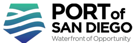
Exhibit B Employment and Ownership Report Submitted to:

Diversity, Equity, and Inclusion Port of San Diego